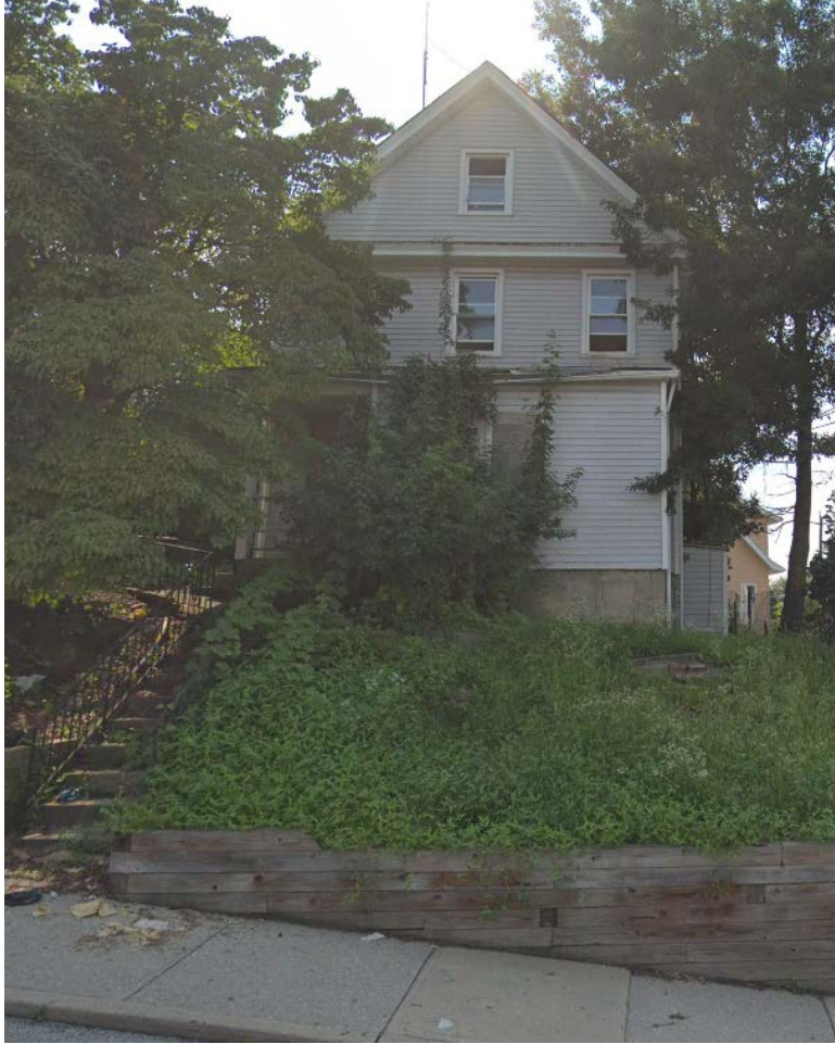
146 Orawaupum Street, White Plains, New York

The City of White Plains, acting through the City Commissioner of Finance, invites proposals for the sale of foreclosed real properties owned by the City of White Plains. The property comprises of one lot totaling approximately .09 of an acre, which contains a two family dwelling located at 146 Orawaupum Street, White Plains, New York to be sold. Detailed descriptions and instructions to proposers, as well as a sample contract of sale are contained in the attached document.